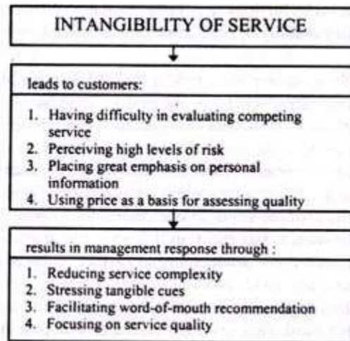
Table 1: Intangibility: challenges and management response

b) Perishability: Perishability is used in services marketing to define how services are unpreserved and cannot be warehoused for future usage. Service products have a very peculiar characteristic that it cannot be warehoused, refunded, or resold once they have been used. Once a customer is provided with a service product, another customer cannot be serviced with the same product thereafter. Service products are attributed to be perishable in two ways. First, it has to be remembered that a service gets wasted if not used in time. For example, a movie theatre can only sell tickets before the show. The customers can attend the show during the defined show timing only. An empty seat in the theatre cannot be utilized and charged for after show has ended. Secondly, services get vanished once consumed by a consumer. For example, as a tourist has been transported to his destination through Indian railways, he/she cannot be transported again to this location at this point in time.